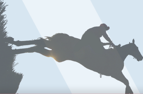
Bryony Frost and Frodon following their victory at the 2019 Cheltenham Festival